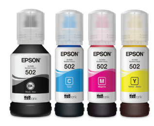
Replacement ink bottles

Product protection you can count on — standard 2-year limited warranty<sup>7</sup>