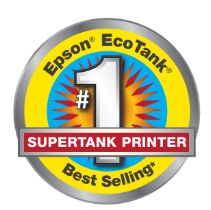
*The NPD Group, Inc., Total Channel Tracking Service, U.S. & Canada, Printers, Refillable ink tank included, based on units, August 2017 – July 2018. Supertank printers are defined as refillable ink tank printers.

1 Based on average monthly document print volumes of about 300 pages.